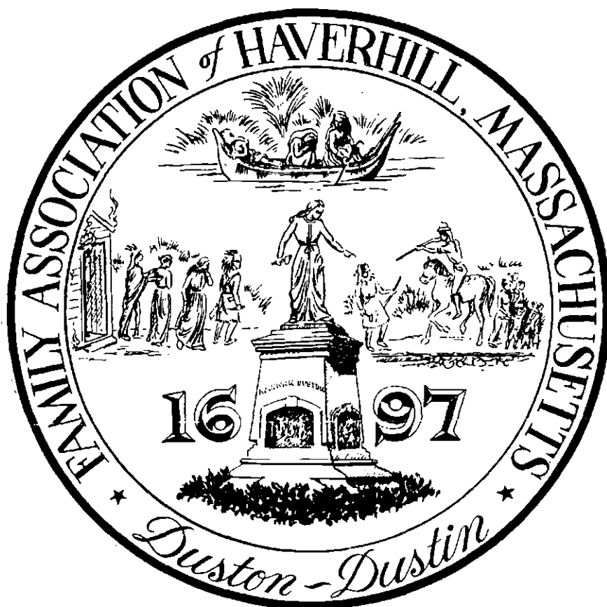
The Seal of the Duston-Dustin Family Association